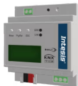
DALI-2 to KNX - 1 DALI channel

The Intesis DALI-2 to KNX TP PRO Gateway is a multi-master application controller for DALI-2 ballast integration into a KNX system. It enables standard switching/dimming, color control, emergency lighting management, and operating hours recording, with error analysis for interoperability in building automation setups.