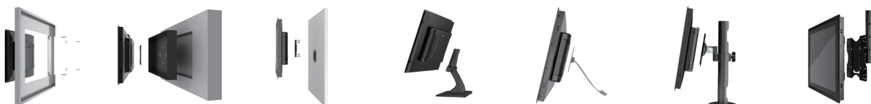
Embedded installation Embedded installation Wall mounted installation Desktop installation Louver installation Cantilever installation Boom type installation