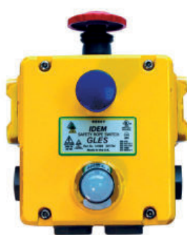
Type: GLES *not EX