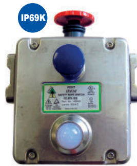
Type: GLES-SS *not EX